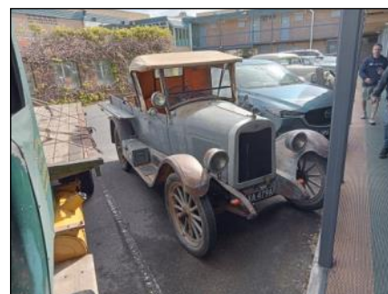
Some of the other cars at the motel in Adelaide