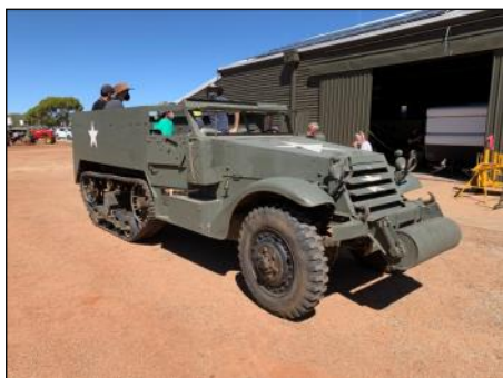
People going for a ride in a half-track at Nungarin.