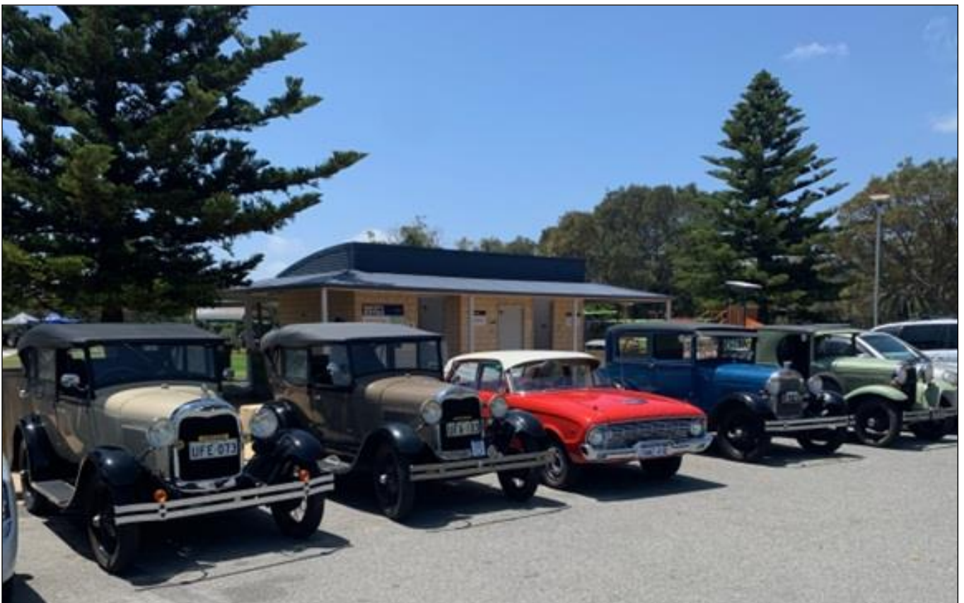
The cars at Wells Park, Kwinana

Looks like the Tractor Museum will have to wait until next year.