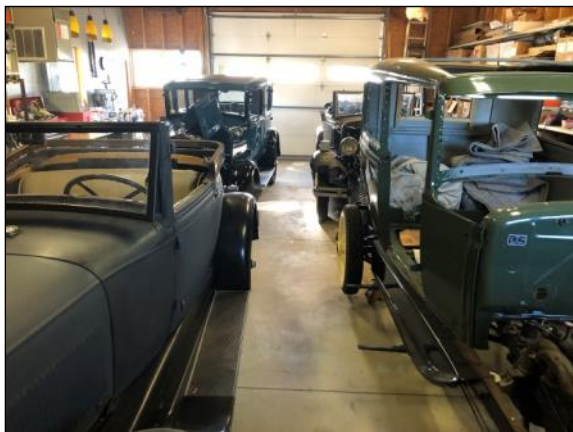
Tom's cars in Colorado:

Front row: 1929 68A Cabriolet & 1931 Tudor