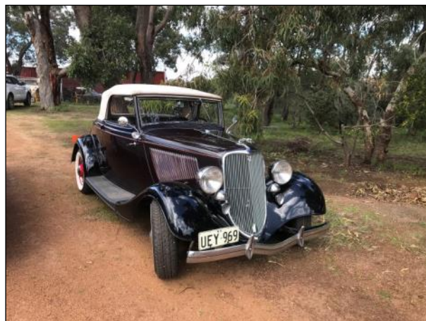
Tom Eastough’s V8