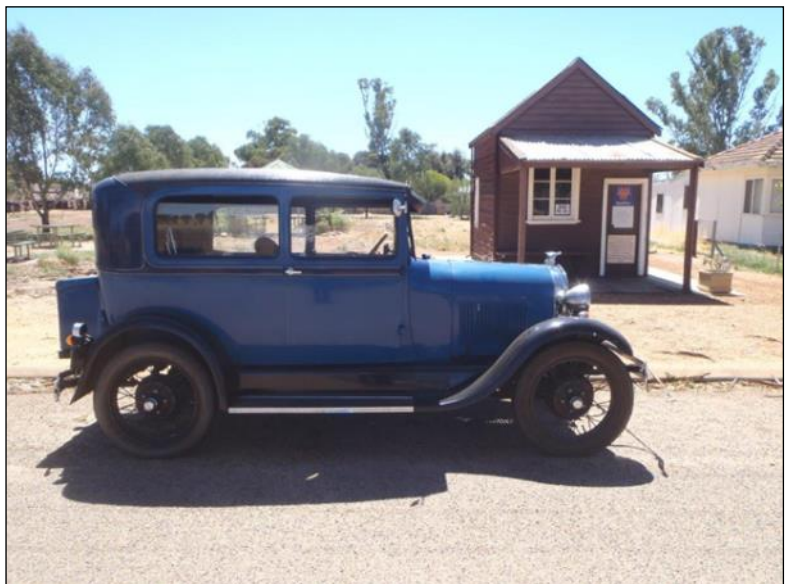
Shackleton's closed little bank & Post Office