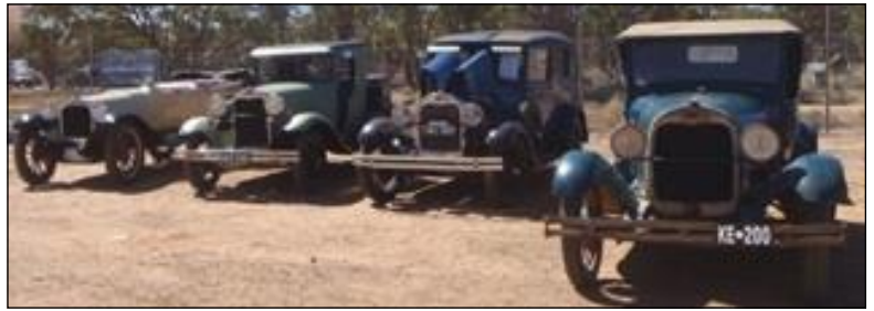
A few of the display cars

The return trip was uneventful with very little traffic until getting on Great Eastern Highway. The temperature in Perth was 36 deg and very hot inside the car with a digital gauge near the floor showing 47 degrees - but the car did not over-heat, even up the sometimes long hills. I travelled a total of 760km for the 3 day 'rally' and was pleasantly surprised to average 21 MPG (13.5 l/100km). It was a great trip and although I was apprehensive, I think I would take a more leisurely trip next time.