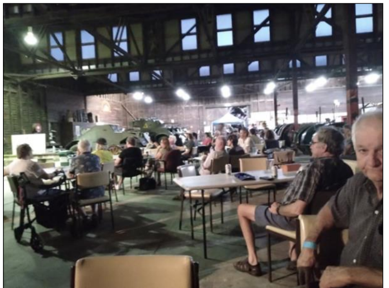
The crowd in the big shed