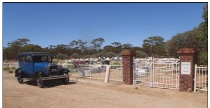
Parked outside Nungarin Cemetery