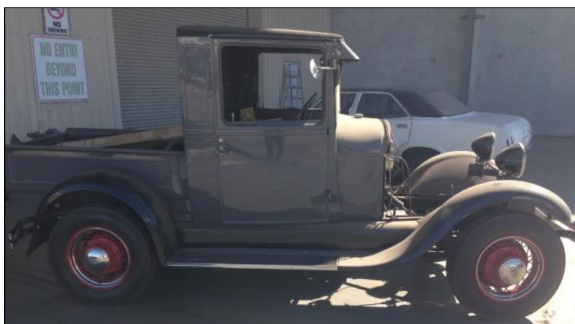
1928 Ute (engine being rebuilt)