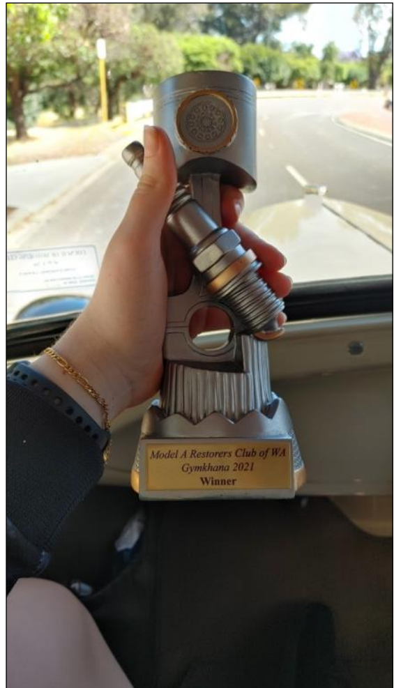
The winner's trophy