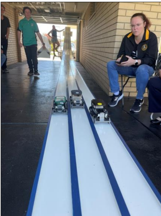
Spectators watch with bated breath

It was another great day of Hubley racing courtesy of the Jeffree clan.