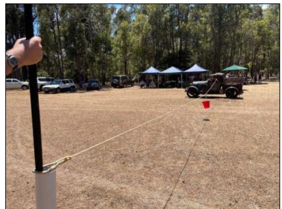
Horace & Jean doing the rope circle

Two laps of the pole keeping the bucket off the ground proved challenging for the first couple of drivers, but, it seemed that waiting for others to try, and observing the