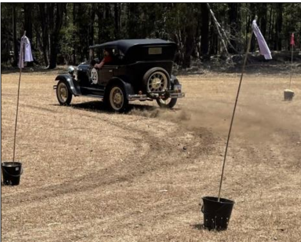
Darryl ripping up the paddock (who else?!)