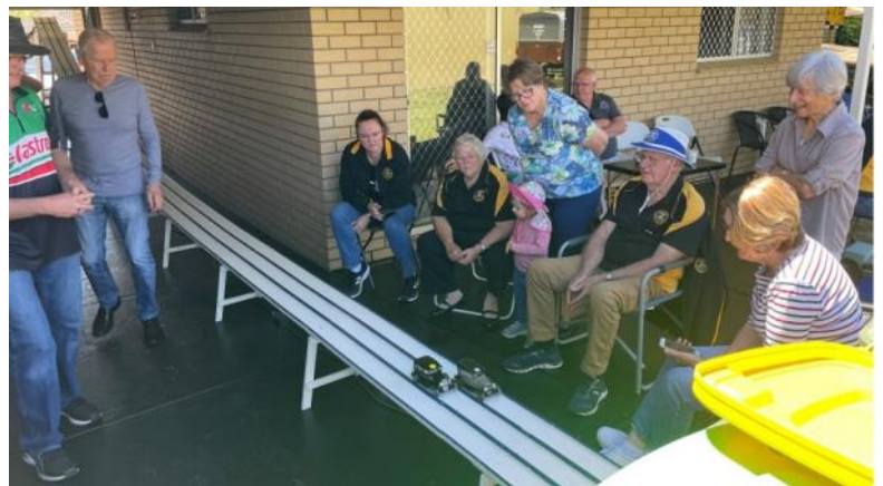
The crowd were engrossed