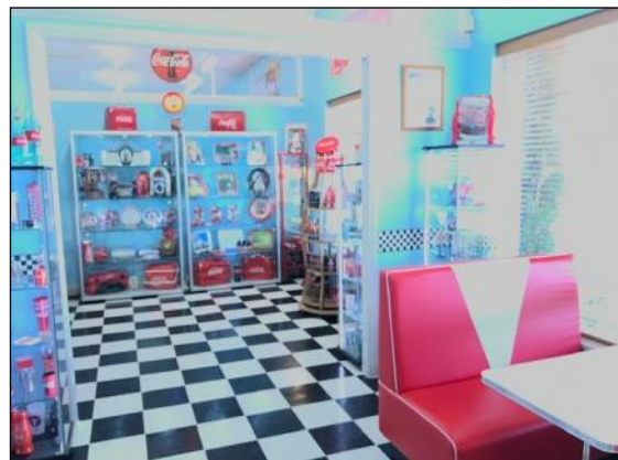
More from the Gas Pump Diner run (see page 7)