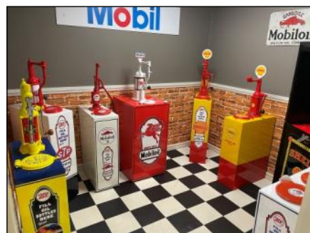
More from the Gas Pump Diner run (see page 7)