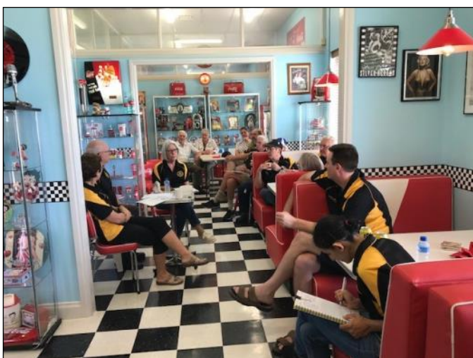
Meeting underway in the diner