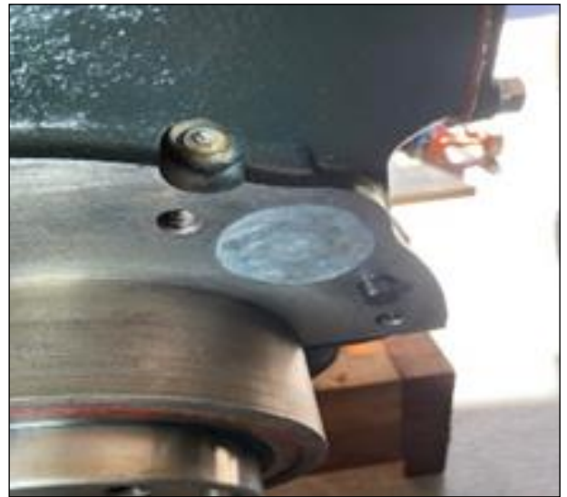
Rear cam plug

Since fitting my new engine, I have done approximately 300 miles, but recently I had to remove the engine as there was quite a lot of oil leaking out of the rear of the camshaft, between the block and flywheel housing. To say I was pissed off is an understatement! Anyway, Horace Misko helped me remove the engine with his lifter. After removing the fly wheel housing, we both wondered why so much oil was leaking. We checked the face of the housing for true - it had a 5 thou warp where it covered the back of the camshaft, so off to a local machine shop and had it refaced.