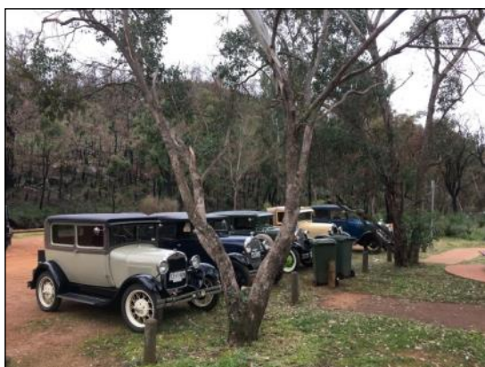
Lunch gathering at Noble Falls.

Until this point, the weather gods had smiled on the group, and as we set for lunch, the first of the rain started to lightly fall. The fear of the pending front seemed unfounded, as there was only a brief shower, then patches of blue sky.