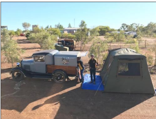
NW MARC run - The Jeffree's camp site at Marble Bar