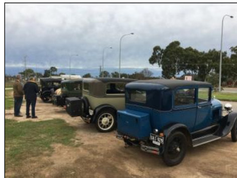
At the start, looking at the front.