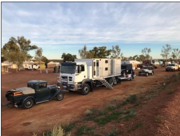
North West Run crew at Paynes Find