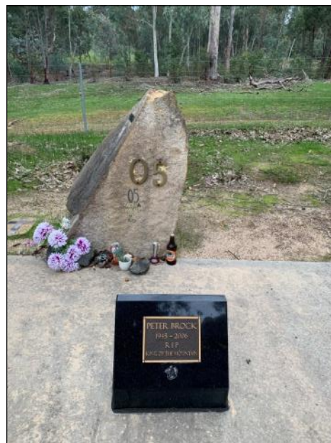
Peter Brock Memorial on Clenton Road.

The run, though not as long as some previous, was intended as a driver's course. O'Brien Rd has developed a reputation among motoring groups for its challenges. There have been numerous serious crashes, and a few fatalities, including the legendary Peter Brock during a stage of the 2006 Targa West rally. The hairpin turns and single lane bridge are a rarity this close to the metropolitan area. Combined with the terrain, fire scars, new