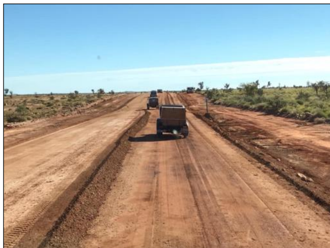
NW MARC run - Model A's on red dirt roadworks