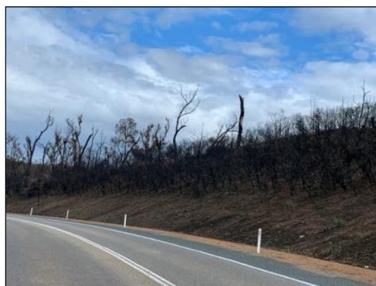
Some of the devastation along the way.

of recovering. The new green foliage, assisted by a better than average rainfall, belies the destruction ravaged on the fire ground in February.