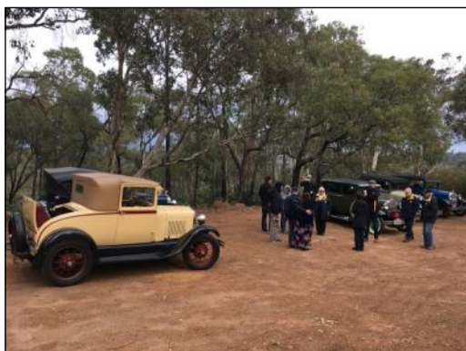
Morning tea at the scenic look-out.

For all of the worry, the old adage of "it'll be alright on the night" seemed to ring true. The weather looked as if it would hold, and the group departed with yours truly on the lead. Of course, the organiser of the run knows where he is going, right? The run sheet clearly states "after 7 miles, turn left on to O'Brien Rd". For reasons still unknown to the author, it wasn't until myself, closely followed by another member, arrived in the Gidgegannup village, did we realise we had travelled about twice as far up Toodyay Road as was required. An embarrassed U-turn was performed and a return to the prescribed route was greeted at the morning tea area with a bit of mirth and applause.