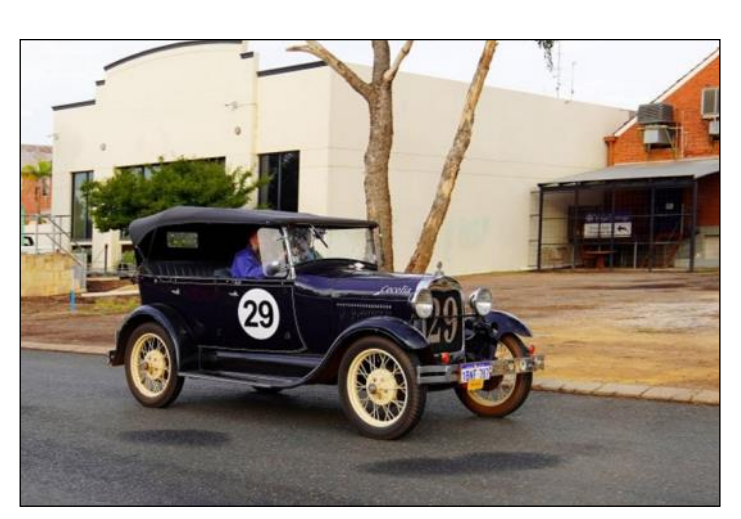
Northam Flying Fifty

We parked in the middle of town on a vacant lot designated for trailer parking on the next day of the race. We pootled around in Cecelia (note: how do you put this in an impromptu run?) and spent a few hours in the Farmers Home Hotel (glam) to do our bit for the community while watching the volunteers set up for the big event. I personally love hard work; I can watch it all day long. I wasn't so enthusiastic when these volunteers started setting up the track's concrete barriers and safety chains from midnight! I should have read the fine print — what a racket! The amount of infrastructure that