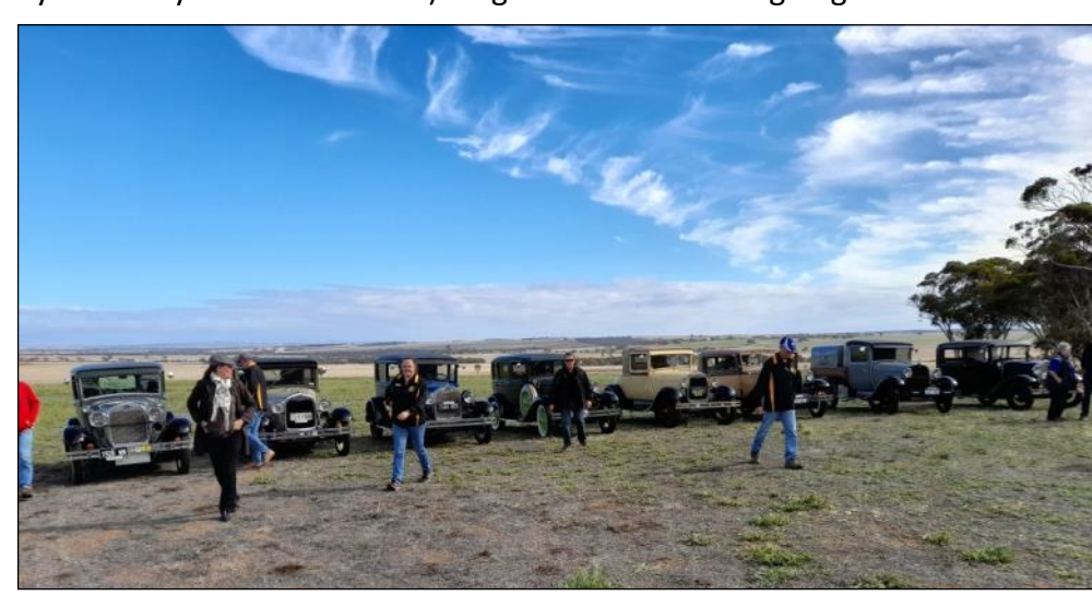
Everyone fleeing to get out of the photographer's way

cooking some sausages. It turned out to be a glorious day for the drive and the inclement weather held off until the middle of the afternoon - when most people were on their way home.