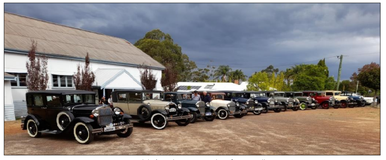
Model A's at the Kirup Op-Shop / Town Hall