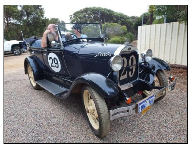
Where did they go?

On the Sunday, we shuffled Cecelia over to the car display area before being locked out of our parking area. Again, the turn-out for the static display was minimal. The upside is we had awesome vantage points wherever we wanted around the track! It seemed there was no shortage of racers and the event went ahead despite the intermittent drizzle. It was great to see some of the Perko racers from the Vintage