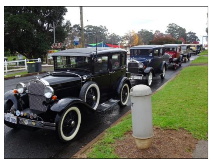
Winter Getaway: Pemberton