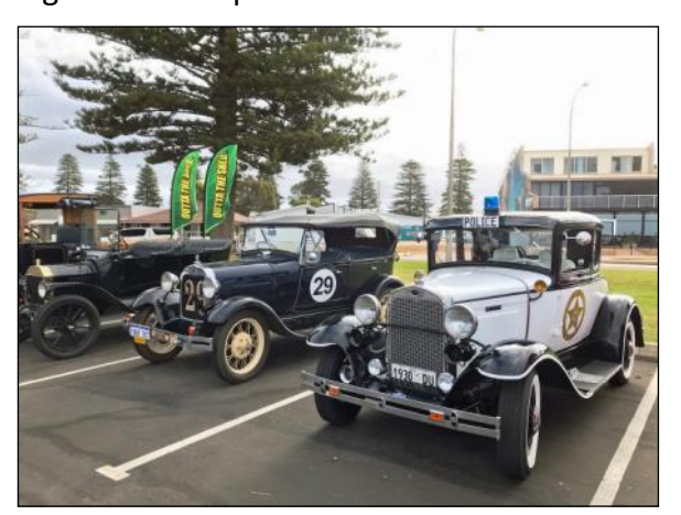
Esperance "Outta The Shed"

Saturday, we headed to Esperance, arriving in time for the Go-to-Whoa. First, we set up camp in the yard at the VCC Esperance clubrooms and then we acted valet to Madame Cook's luggage. Sporty Chugg does not 'Do Luggage'. At the Go-to-Whoa, plenty of muscular cars were jeered and cheered as they roared away and squealed to a stop again. I had flashback to our Collie mis-adventure (see previous edition). There was an arranged cruise around town during which we promptly got separated from the lead cars; it is, as ever, only a matter of time. Sunday was the show and shine. We dropped the cars off early and were then