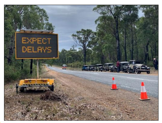
Winter Getaway: a telling sign