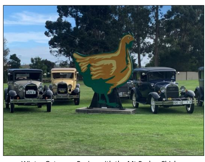
Winter Getaway: Posing with the Mt Barker Chicken