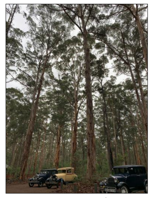
Winter Getaway: cars in the Karri