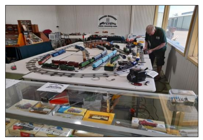
Model train setup in Dardanup Heritage Park

Next was Donnybrook for lunch, the Kirup Op-Shop, then to Busselton for another 2 night stay.