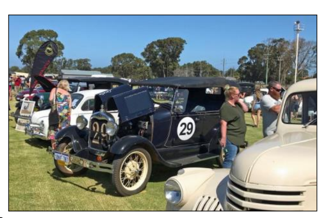
Esperance "Outta The Shed"

We missed the Perth-Sou' West Easter traffic, but were right on time for the Wheatbelt-South Coast traffic! In Hopetoun, we parked up in the designated RV area on the foreshore and offloaded Cecelia for a pootle around town. Cooks and family were staying in a rabbit warren called a caravan park and we eventually found them there. How they got the F250 and car trailer in there, I don't know, but it was going to be fun getting it out again! We dined and made our way back to camp with the aid of 1000 lumen torch held over the windscreen. I didn't realise Celie's lights were so poor.