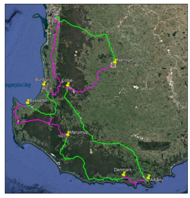
Winter Getaway: route

\underline{http://modela fordclub.com.au/wp-content/uploads/2021/05/Red-Dust-Revival-2022-Newsletter-1.pdf}