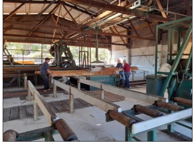
Operating timber mill at Dardanup Heritage Park