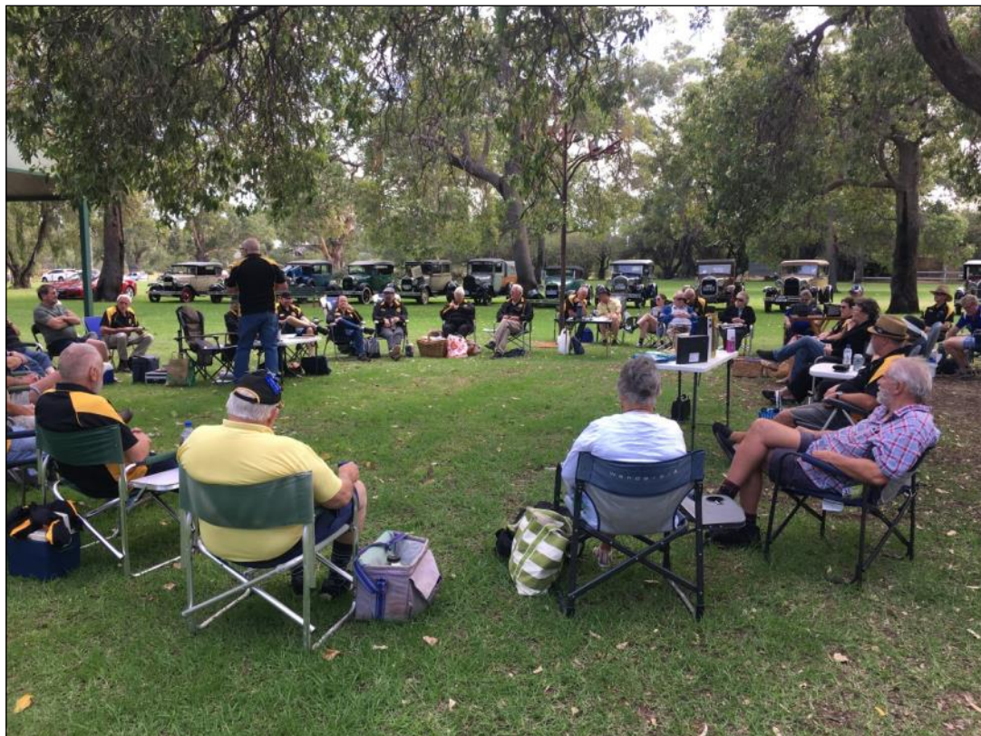
The meeting under-way