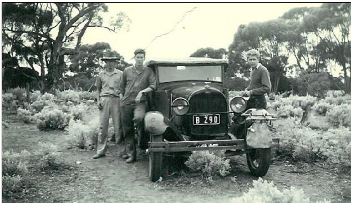
On a little used road, 1963