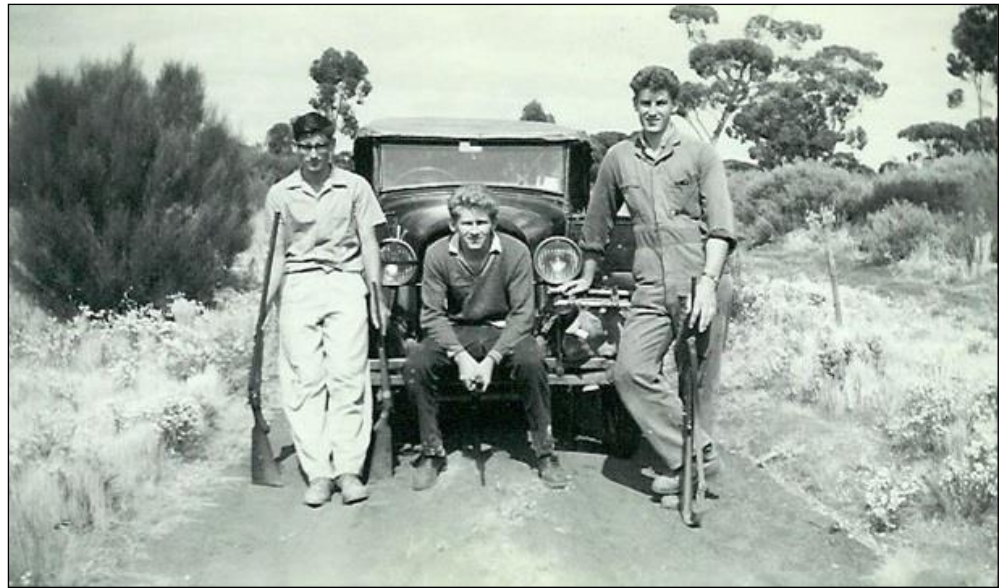
South of where Kambalda now is, 1963