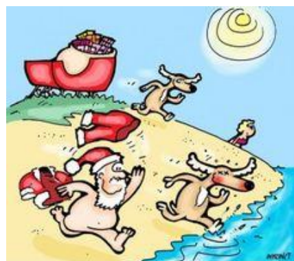
The Aussie spirit of Christmas.