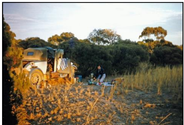
Breaking camp Wirulla to Wundinna, South Australia