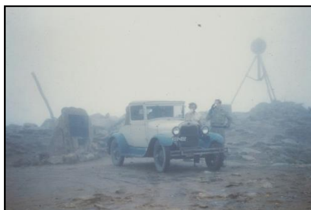
Kosciuszko—toasting the ascent

Onward to Canberra and then Sydney, where eventually the A Model was loaded onto the Wanganella, bound for Wellington, New Zealand. Not long after the journey began, everyone on the boat could hear a horn blaring. It was the A Model. Someone had tried the horn, it had got stuck and continued to sound – until the battery eventually went flat!