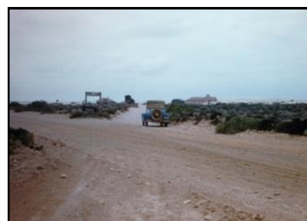
Driving into Eucla Telegraph Station