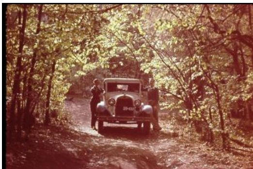
Near Mutton Lake Mt Gambier