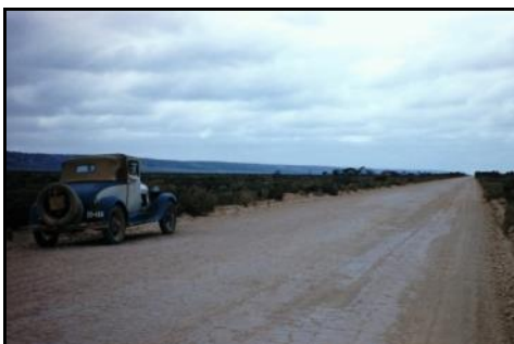
20 miles West of Eucla