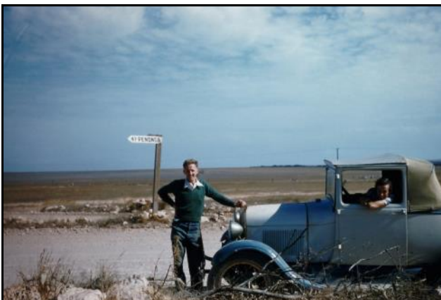
On the way to Penong