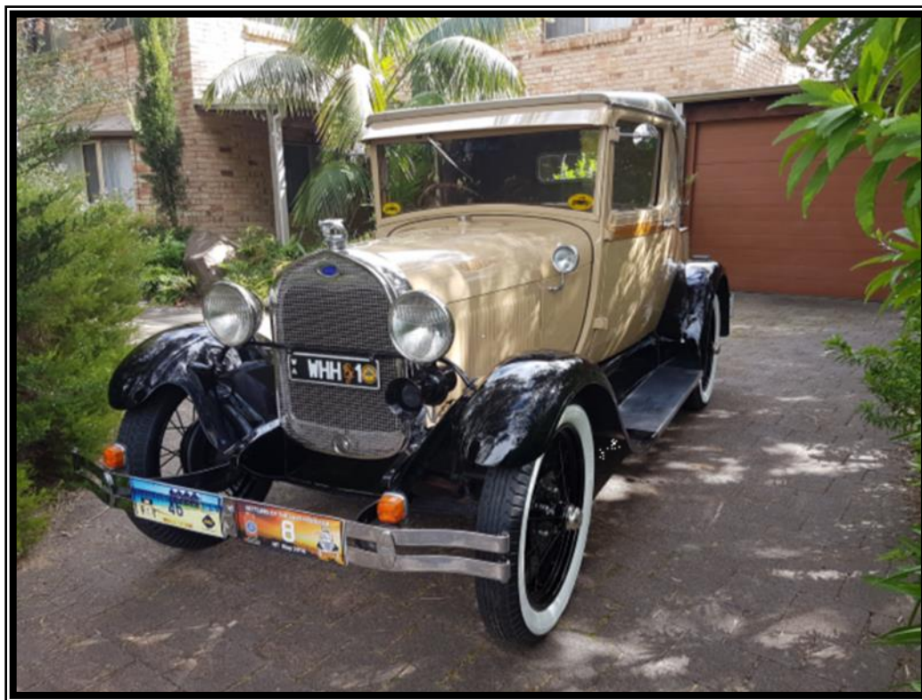
Wes Hartley and Beverley Biggs' 1928 Sports Coupé (Model 50A) in 2018