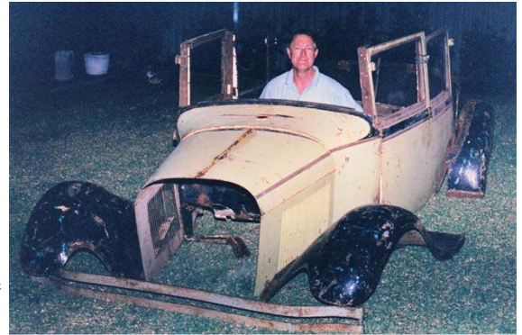
Not a lot to start with!