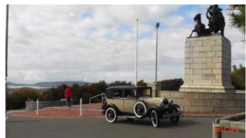
Bob’s Run 2011 Mt Clarence in Albany