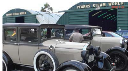
Tassie a second time