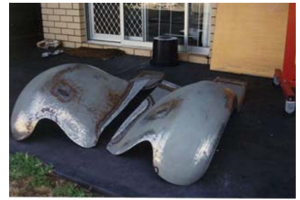
Two front guards ready to prepare for paint.

The Fordor has won a couple of prizes: Top Ford 1920-1929 at the All Ford Day 2003 (WA) and Top Closed 1928/29 car at the 2004 WA National Model A Meet.