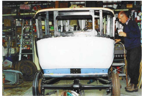
The whole body is wood framed!