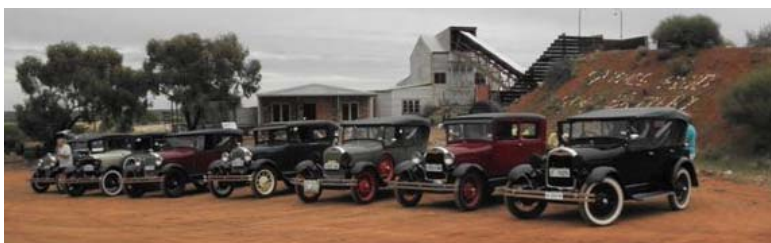
Payne’s Find Tourist mine