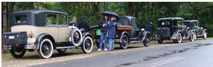
Four Model A’s in Tassie 2005