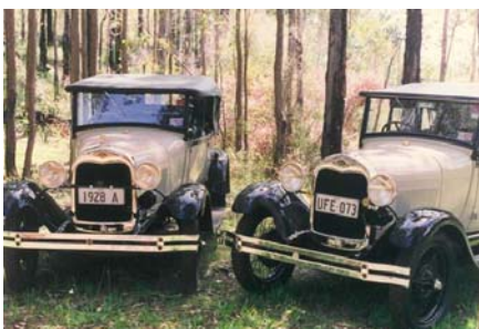
Both Jeffree Phaetons completed 1992.