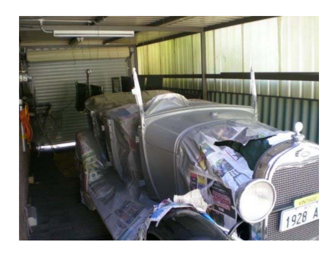
Paintwork in process

When Rob had finished priming the doors, he suggested that we give the remaining body parts a complete repaint to match the doors. The mouldings and pin striping were redone in the correct colours as per the Model A colour chart reference book (available from our club library). I had a go at the pin striping myself and from a distance it looks very good.